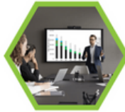
Key Economic and Justification Factors